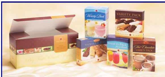
We Sell Health Wise Protein Bars and Drinks